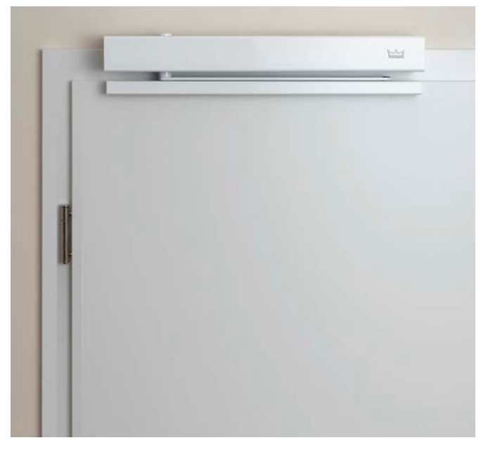
NOTE: The DORMA ED100 and ED250 Series automatic swing door operators are listed UL325 / CSA 22.2 and meet requirements of ANSI/BHMA A156.10 or A156.19 and NFPA 101 with proper application and installation by AAADM certified installers.