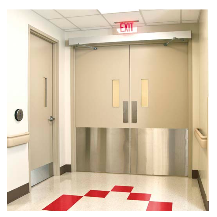
NOTE: The DORMA ED400 and ED700 Series automatic swing door operators are listed UL325 / CSA 22.2 and meet requirements of ANSI/ BHMA A156.10 or A156.19 and NFPA 101 with proper application and installation by AAADM certified installers.

The ED700 may be used for door widths up to 48" (1220 mm) and a maximum weight of 200 lb (91 kg). For best accessibility, the operator can open the door up to an opening angle of 110°.